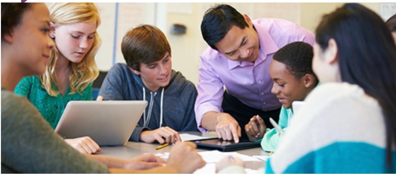
(Resilient Educator, 2013)

When advocating for extra funding for children with special needs, it can be broken down into three strategies to further understand how funding can positively change the learning environment for some students.